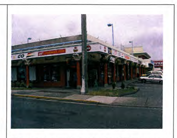
Telephone booths by 24 hour convenience store in shopping centre at 880-890 Esquimalt Road