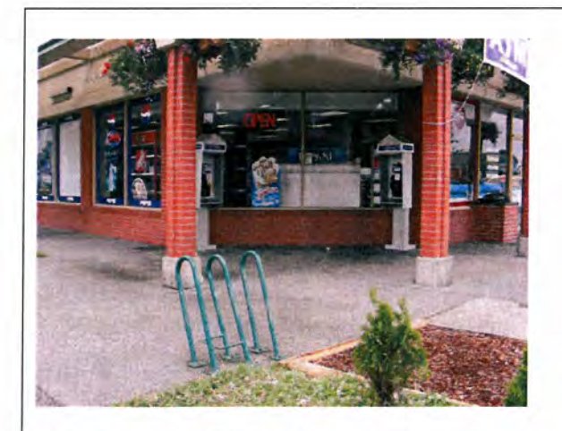
Telephone booths by 24 hour convenience store in shopping centre at 880-890 Esquimalt Road

There are three telephone booths at the intersection of Esquimalt Road and Head Street. Two booths are located in front of the 24 hour convenience store in the shopping centre on the north side of the road at 880-890 Esquimalt Road. There is also one telephone booth in front of the convenience store located on the south-east corner of the intersection adjacent to the eastbound bus stop at 899 Esquimalt Road.