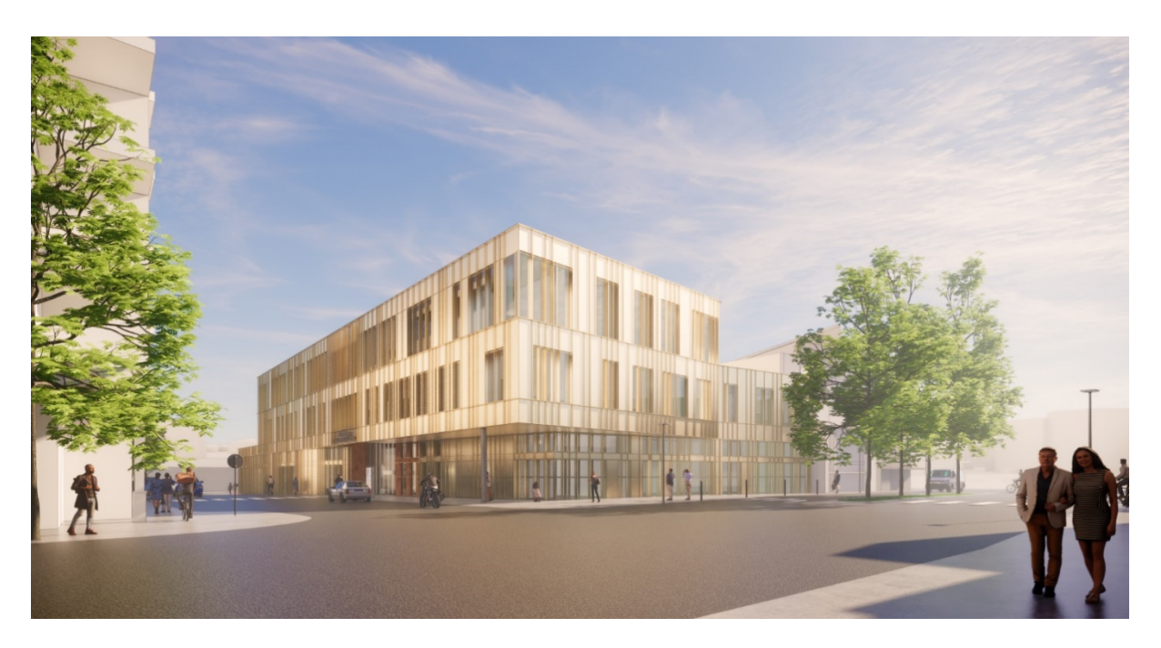
Architectural illustration of proposed design