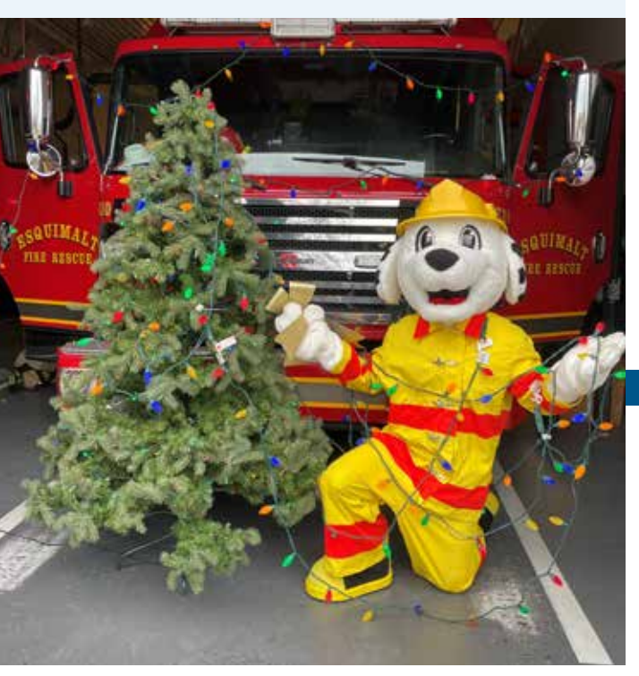
Sparky the Fire Dog practices safety when it comes to holiday decorating.

Dry trees are a very real fire danger. Do not leave them lying against your home or garage.