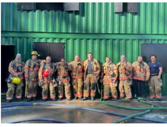
A Platoon after a live-fire training session.

The Esquimalt Fire Department is developing a dynamic strategic plan to guide the fire department over the next five years. This plan will guide the delivery of valued, cost-effective and efficient protective services to the citizens and businesses of the Township of Esquimalt, community partners and other stakeholders.