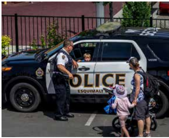
VicPD at the 2019 Neighbourhood Party.

The 2014 Police Framework Agreement is set up for renewal in 2024. The agreement is intended to clarify many aspects of service delivery and governance including sharing of costs of the amalgamated police force, dedicated resources for Esquimalt and City of Victoria, budget approval processes, dispute resolution and performance metrics. The