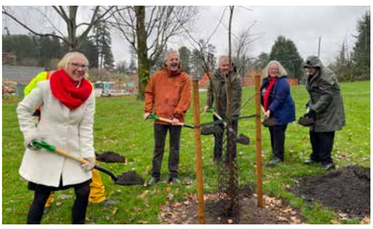
For 100 years, the Victoria Horticultural Society has supported gardeners and gardens in our communities. Congratulations on a history of knowledge and skill! This planting and bench unveiling was November 18.

The Township of Esquimalt in partnership with World Fisheries Trust and the Gorge Waterway Action Society will be receiving a grant from the Pacific Salmon Foundation and the Stewardship Centre of BC to develop a "green shore" at Esquimalt Gorge Park estuary.