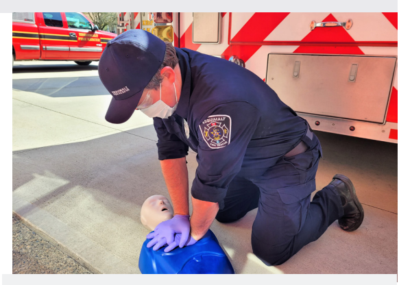
Try CPR at home with one of our first aid mannequins

Registrants will book a dedicated time to receive a CPR mannequin and live training session from an Esquimalt Fire Department member. More information about registration at esquimalt.ca/CPR