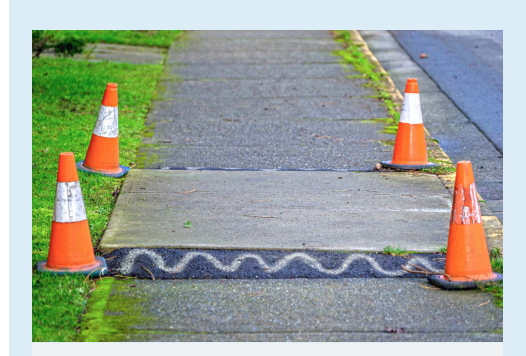
Trip hazards are on the list of summer repairs

Esquimalt Municipal Hall closed: July 1, August 2, Sept 6 & 30