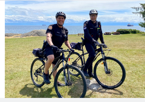
VicPD officers will be out on foot and bike in Esquimalt.

You may see them on foot or bike in the day, evenings and weekends. Please say hello!