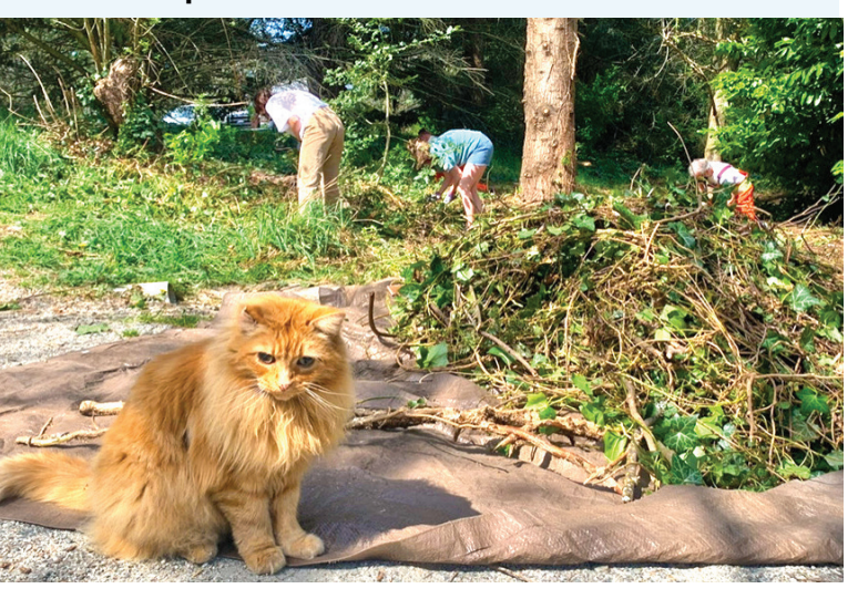
Volunteers remove invasive plants from Esquimalt parks under careful supervision.

If you can't make this event, sign up for a volunteer orientation session in our parks and join us another time. More at www.esquimalt.ca/branchoutvolunteer