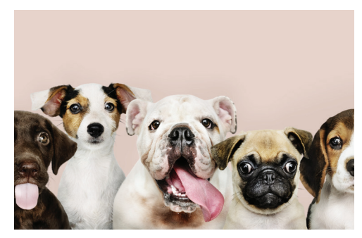
NEW! Dog licences and business licence renewals can be paid online starting late 2021.

Go to esquimalt.ca for complete details on the township's policy regarding election signs on municipal property.