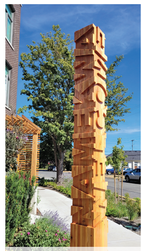
"Welcome" pole at Esquimalt Town Square

Net proceeds raised by the Esquimalt Ribfest are returned to the community through the Esquimalt Firefighters Charitable Foundation and the Esquimalt Ribfest Society. Funds go to local charities and school-sponsored activities for our community's youth. More at www.EsquimaltRibfest.com