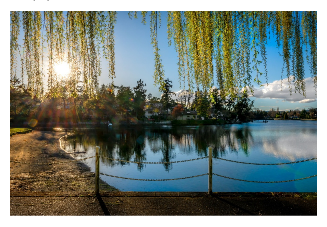
Healthy, livable and diverse community objective: "Enhance opportunities for parks & recreation."

Operational strategies are actions that work to close the gap between where you are starting from and where you want to be, how you intend to reach the strategic goal.