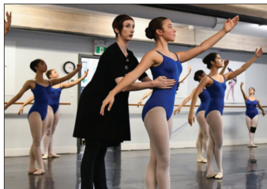
The Victoria Academy of Ballet offers free introductory classes on Saturday, July 10, to celebrate its new home in Quadra Village.

For instance, if a production is looking to film a show set in the summer during the winter, the commission needs to prove that they will have sunny skies, no snow and residential areas with no deciduous trees that would give away the season.