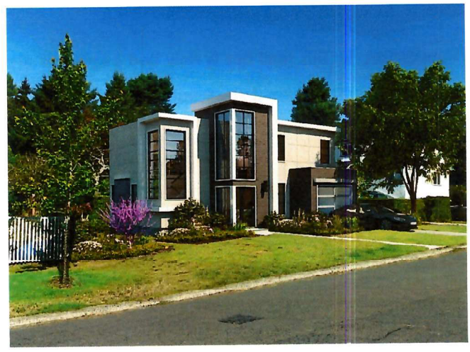
Artist's rendering of proposed new home

Zebra Design & Interiors Group Inc. • 1161Newport Avenue, Victoria BC V8S 5E6 (250) 360-2144 info@zebragroup.ca www.zebragroup.ca