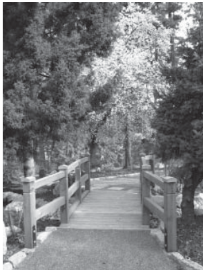
The new Japanese bridge crosses over the refurbished ornamental stream at the Esquimalt Gorge Park.