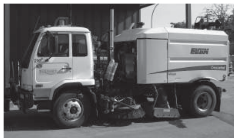
Esquimalt's new Elgin Street Sweeper is a more powerful sweeper with a smaller environmental footprint.

Furthermore, the new sweeper is environmentally-friendly and equipped with several of the latest