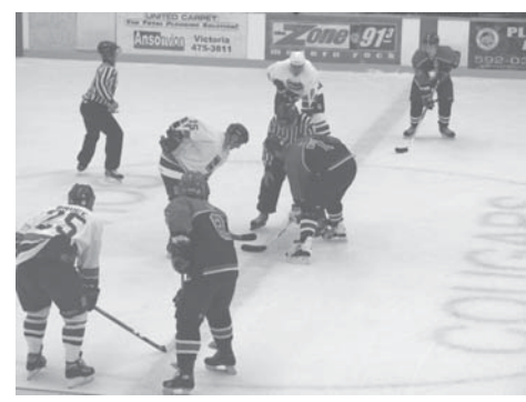
Archie Browning Alumni hockey game

The highlight of the day was an Alumni hockey game, which pitted Canucks Alumni against Victoria/ Esquimalt Minor Hockey coaches. Over 500 fans had a chance to watch both teams show-off their impressive hockey skills. The players provided some comic moments, which