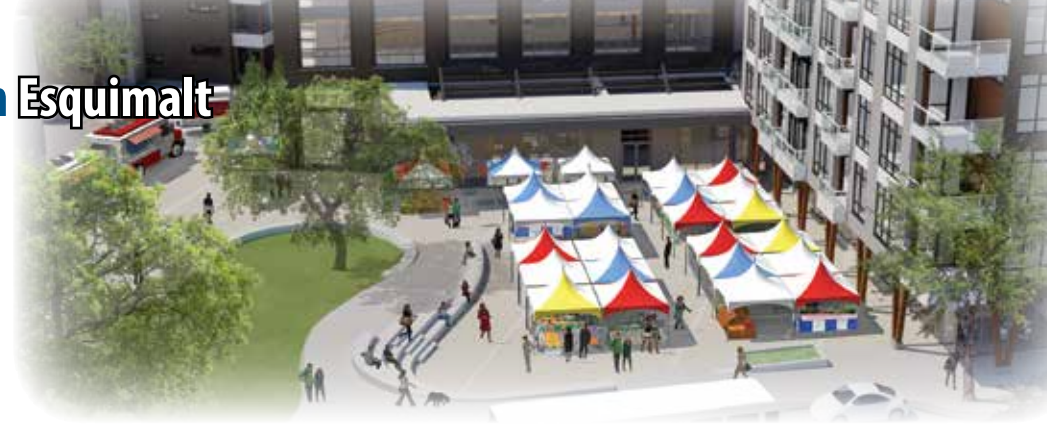
Rendering of market space in Esquimalt Town Square

A public hearing was held on the English Inn property on October 24, 2016. The zoning bylaw amendment was adopted by Council and the Township is currently processing the development permit, development variance permit and the heritage alteration permit on