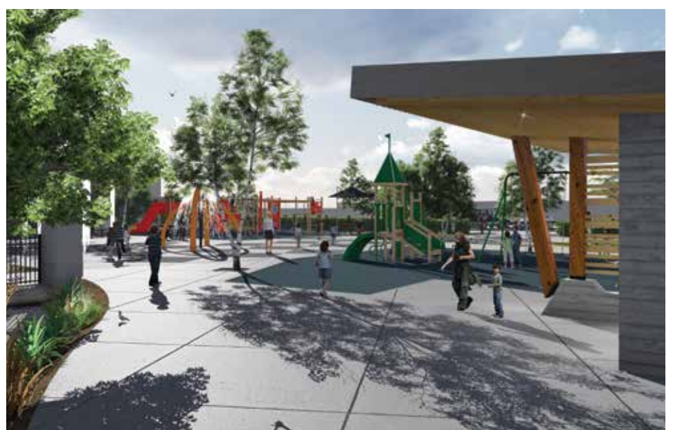
Rendering of entrance to Esquimalt Adventure Park on Fraser Street.

For more information on the Esquimalt Adventure Park, please visit: https://www.esquimalt.ca/parks-recreation