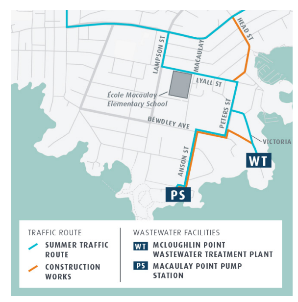
During the summer, truck traffic will use an alternate route to the sites at McLoughlin Point and Macaulay Point.

Concrete pouring continues at both McLoughlin Point and the new Macaulay Point Pump Station.