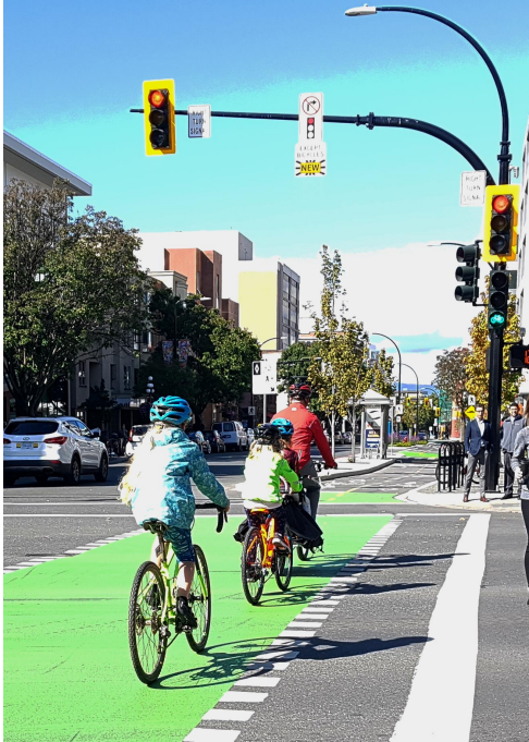
Protected Bike Lanes