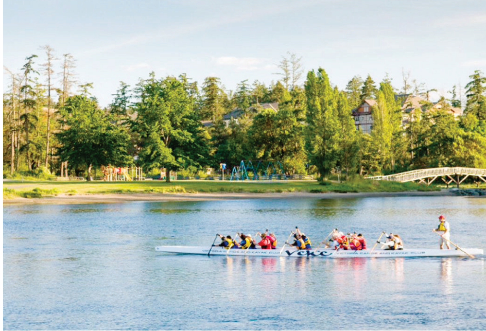
Honouring our past. Celebrating our present. Imagining our future.