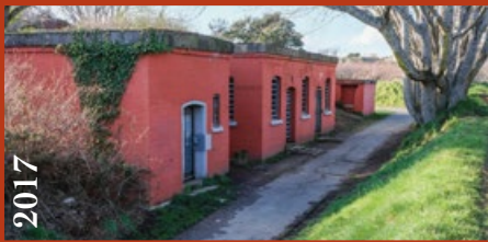
1903 plans of the (still standing) Artillery Stores, Skidding Stores, Smith's Shop and Fitter's Shop. The Machine Gun Ammunition Stores building is in the background.