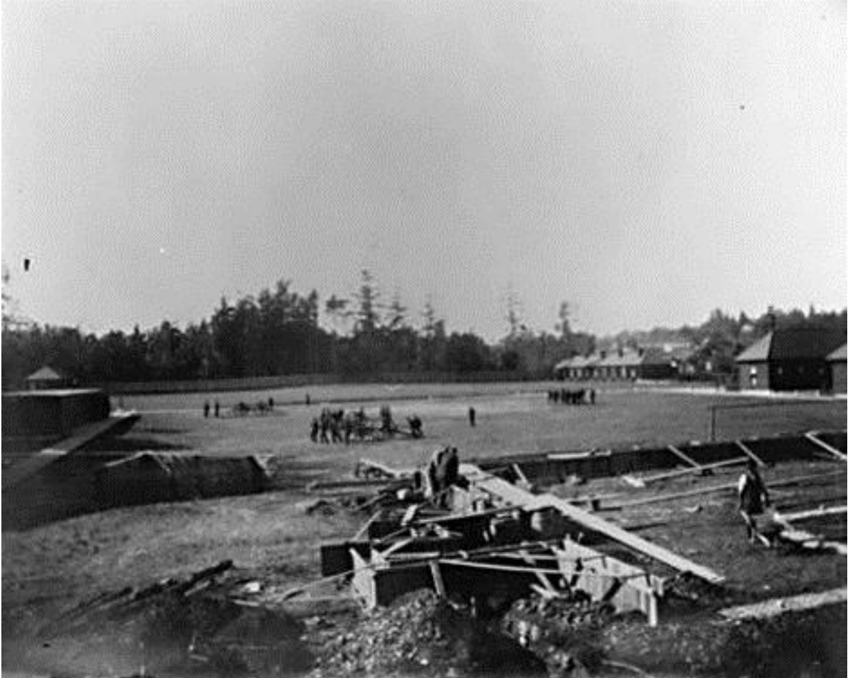
Work Point, looking west over the construction of the "Works Office" at Work Point Barracks circa 1893. In the background are the Royal Marine Artillery with their muzzle-loader carriage guns in the Parade Square and the Enlisted Men's Barracks to the far right.

The 1880s brought major changes to the region. In 1886, the Esquimalt & Nanaimo Railway was constructed through the centre of Esquimalt. The following year, a military base was established at Work Point Barracks near the Victoria city boundary. It was the garrison headquarters for the first Permanent Force unit "C" Battery, Canadian Artillery for coastal defence, and played an essential role in protecting and guaranteeing Canada's sovereignty. Operation of a number of gun emplacements such as Macaulay Point, Finlayson Point and Brothers Island were necessary to protect both Victoria and Esquimalt harbours, and larger portions of Esquimalt lands were taken over by the crown for military operations. In 1887, the naval dockyard was completed, giving the Royal Navy a state-of-the-art ship repair and refitting site on Canadian soil. As the area's population grew, the presence of the Navy and the Army dominated social life both in Victoria and Esquimalt. Wealthy businessmen built large homes in Esquimalt along the shoreline, the banks of the Gorge and the rocky hillsides near Old Esquimalt Road, while more modest residential development took place in the southern part of the Township. In 1893, the gunners of the Royal Marine Artillery at Work Point built the province's first golf links on the Macaulay Plains.