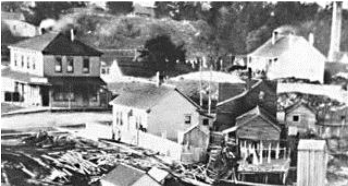
Esquimalt Old Village, pre-1904

The last British Army garrison in Canada left Victoria and Esquimalt in 1906, leaving the Government of Canada in charge of Military District #11 (BC) Headquarters at Work Point, with Canadian Artillery Gunners responsible for Coastal Defence. Although the Royal Navy abandoned the naval base in 1905, it was revived in 1910 as the West Coast base for the newly-created Naval Service of Canada [renamed the Royal Canadian Navy in 1911] and continued to play an important role – along with the Military – in the life of the community.