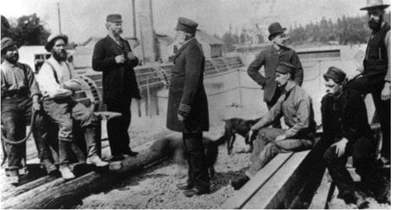
First Graving Dock, Naden, Esquimalt, 1887 [Young Collection, Esquimalt Archives 995.24]