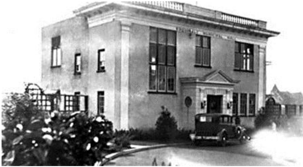
Esquimalt Municipal Hall, 1930s.