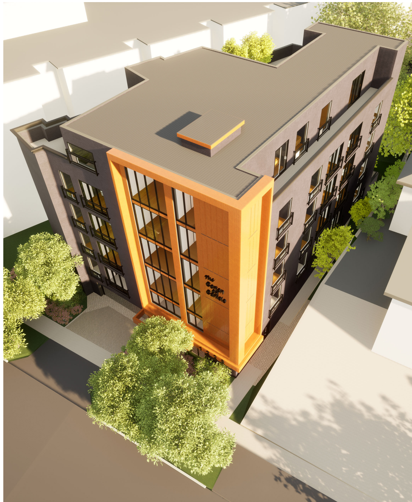
BIRD'S EYE VIEW - NW CORNER