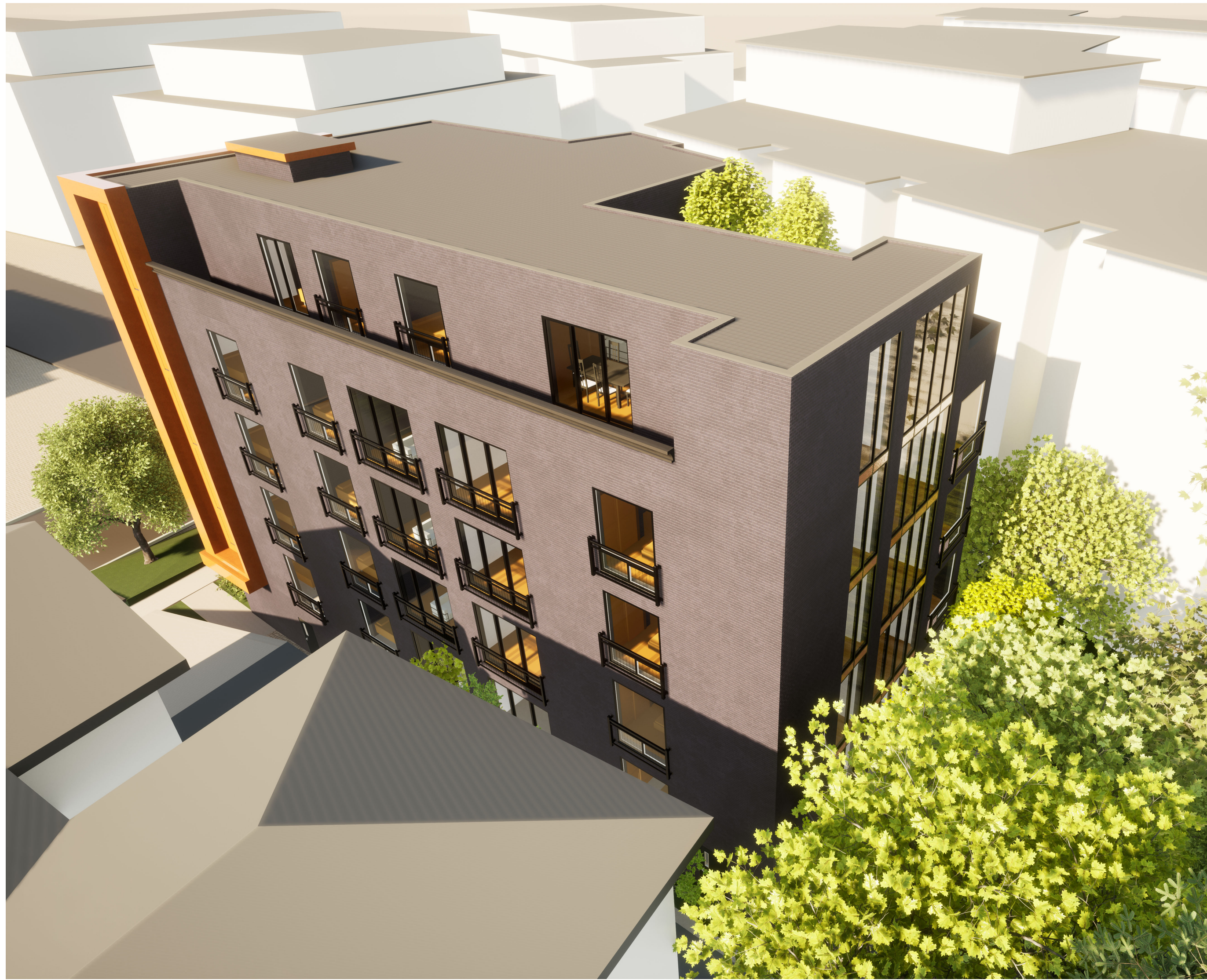
BIRD'S EYE VIEW - SW CORNER