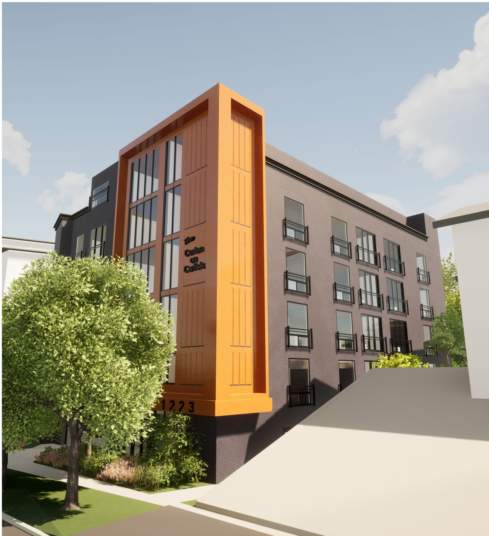
GROUND VIEW - NW CORNER