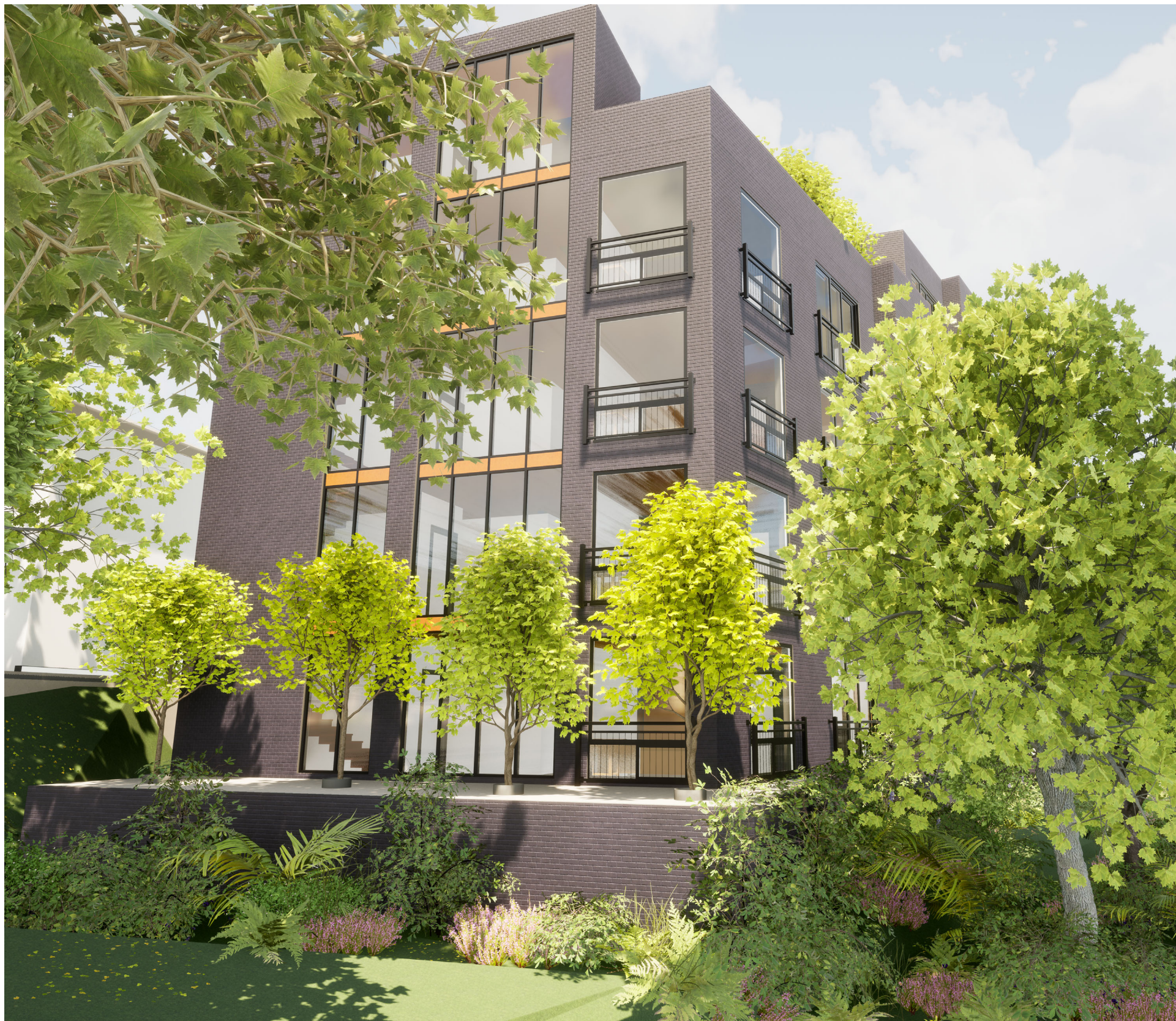
GROUND VIEW - SE CORNER