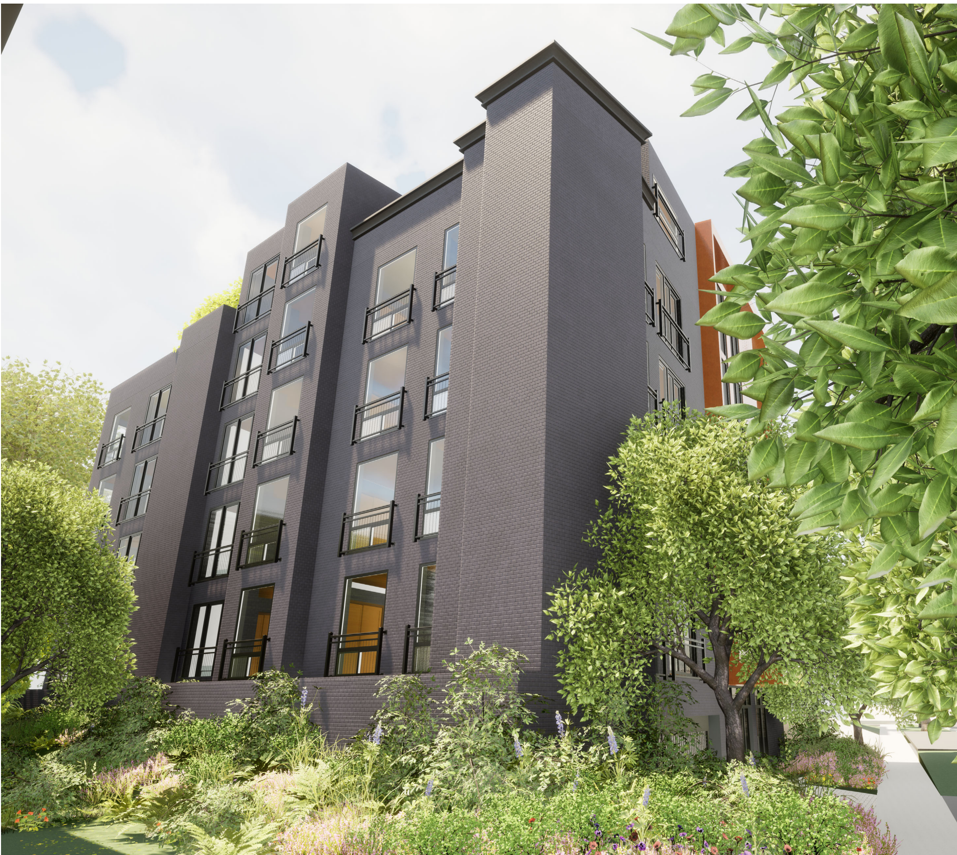
GROUND VIEW - NE CORNER