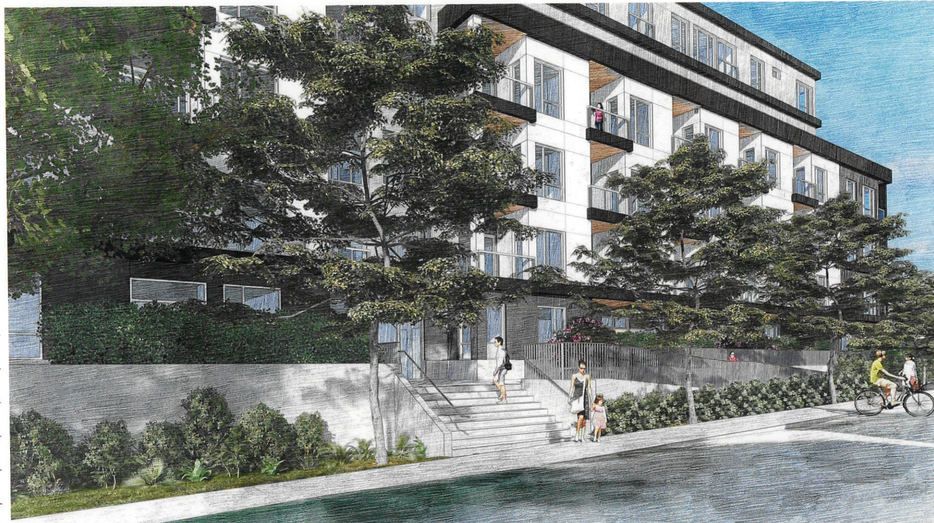
MAIN ENTRY - WEST BAY TERRACE