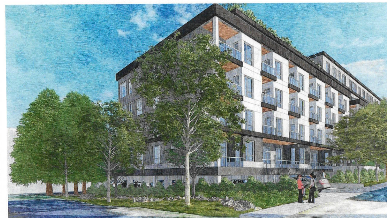
LANDSCAPING AT SOUTH END - WEST BAY TERRACE