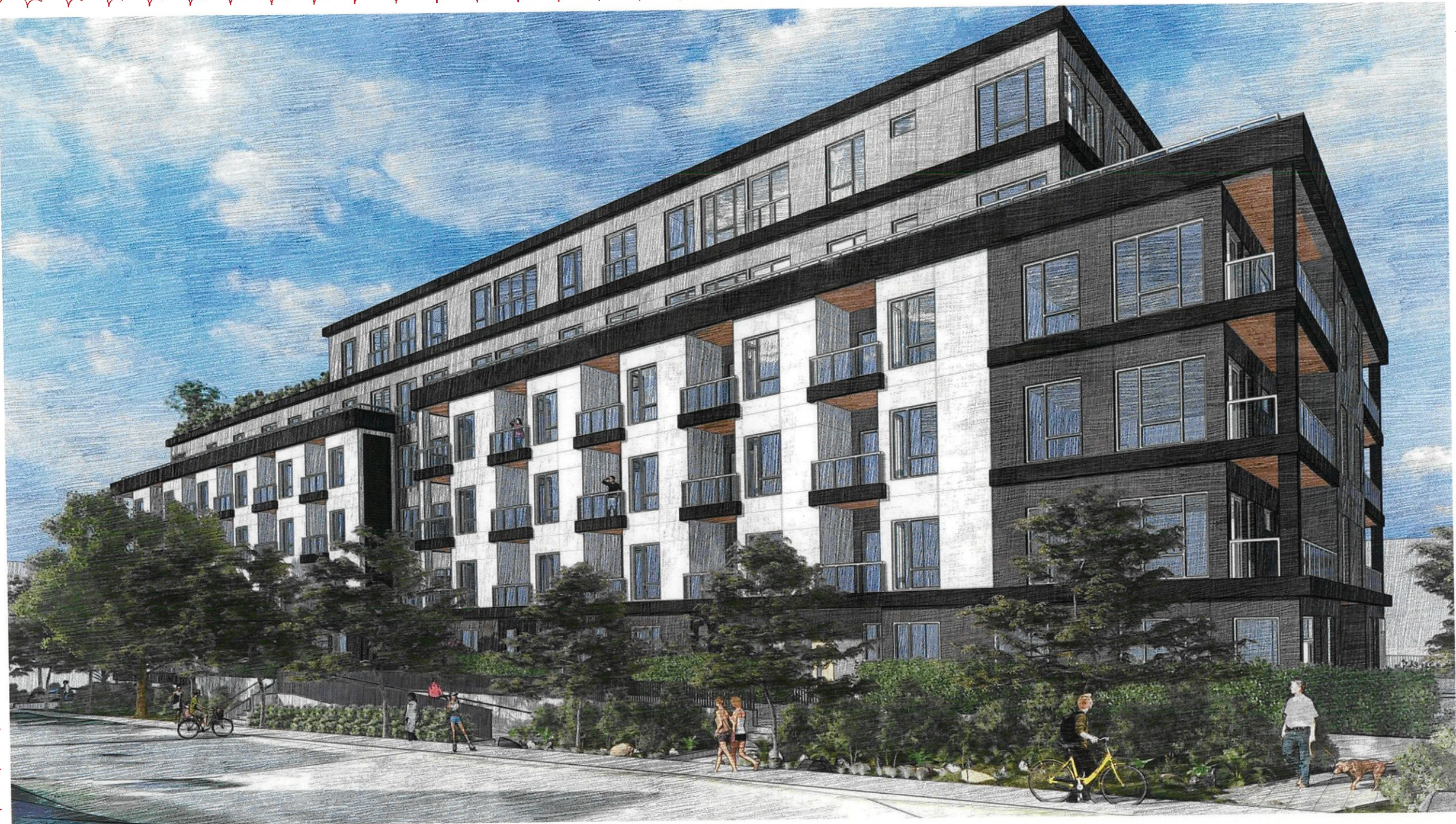
PRIMARY ELEVATION - WEST BAY TERRACE