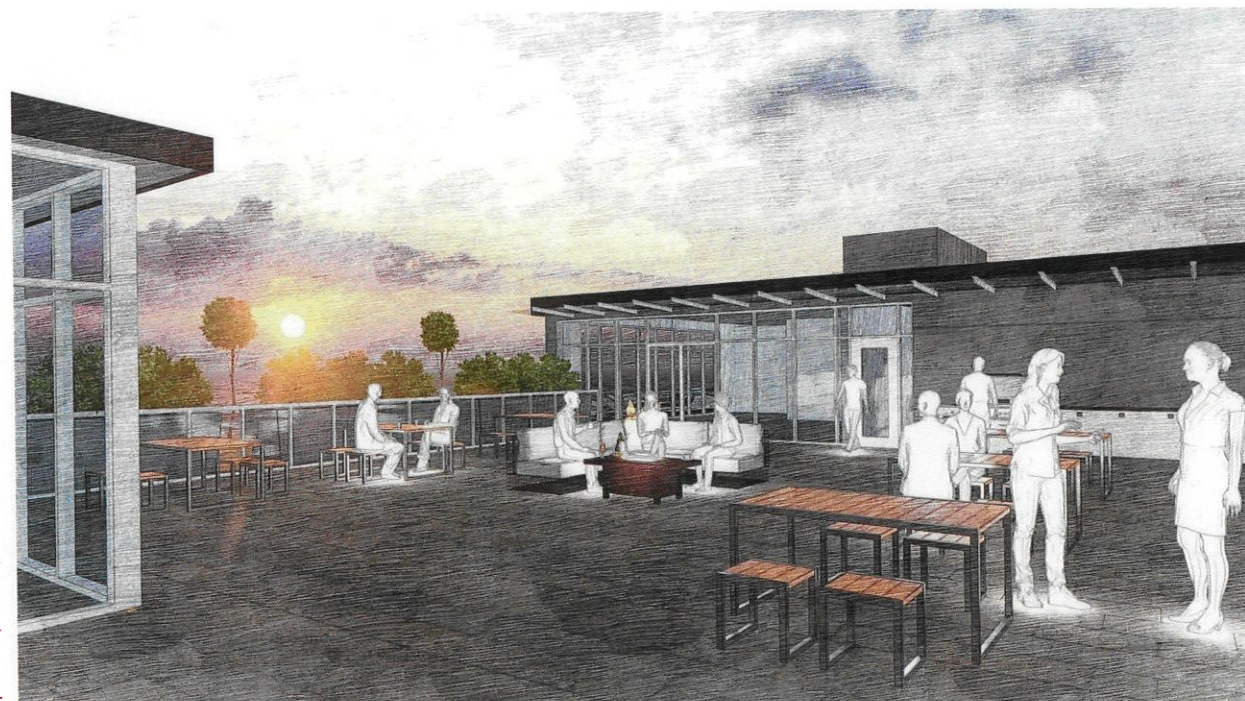
ROOF AMENITY - LOOKING NORTHWEST