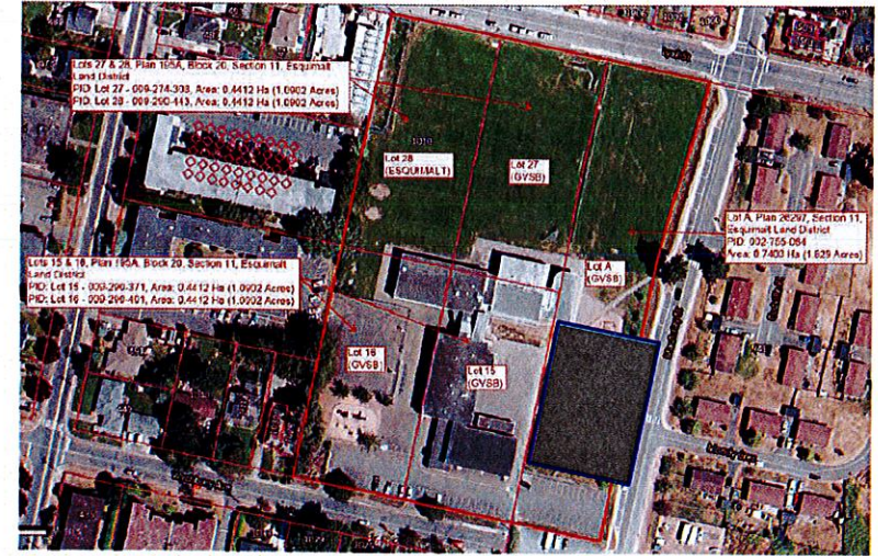
3 PROPERTY PLAN A1.0 NTS