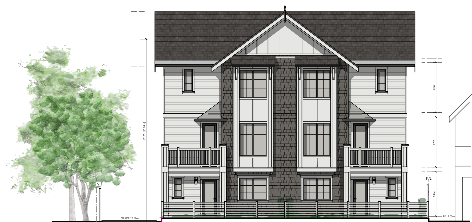
2 Proposed Street Facing Elevation A1 Scale: 1:100