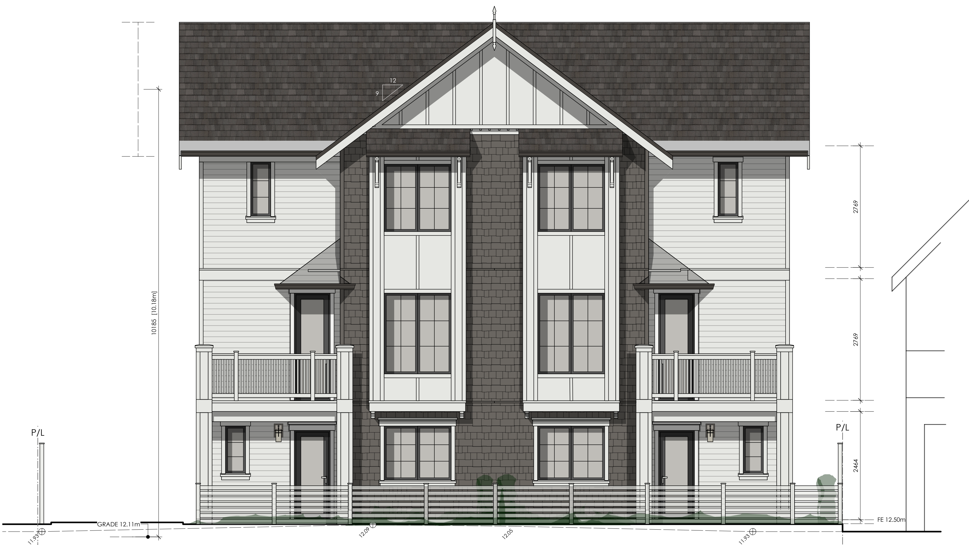
1 A3 West (Grafton) Elevation Scale: 1:50