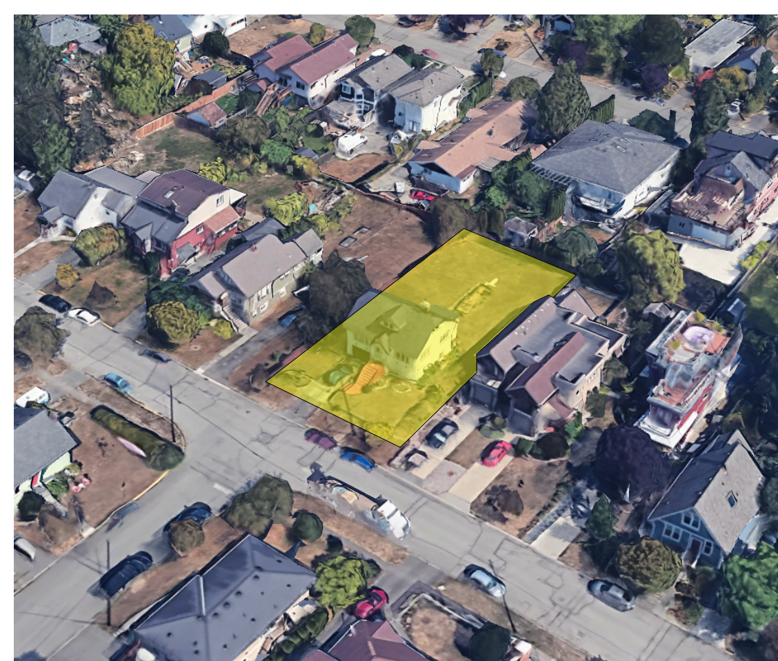
Aerial View of Subject Property