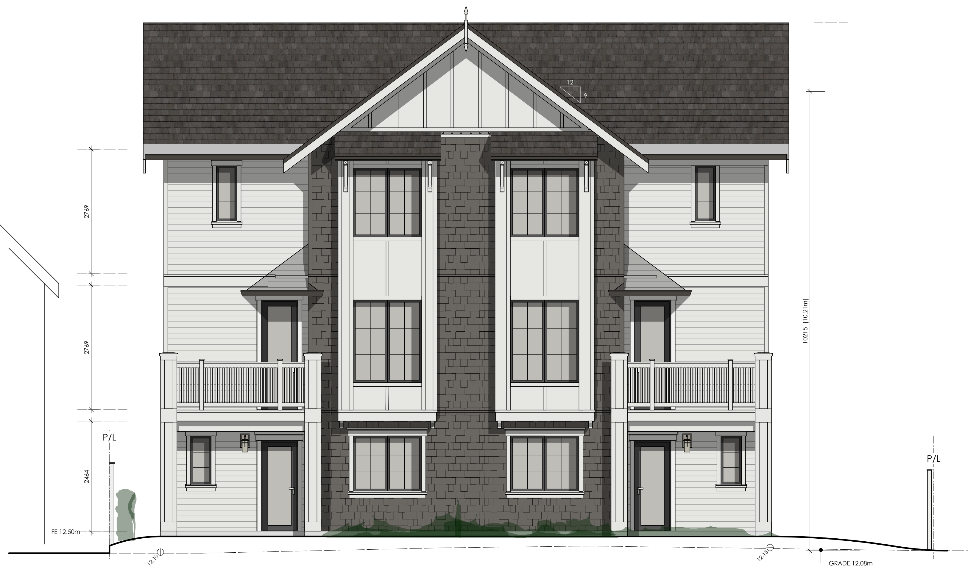
1 East Elevation A5 Scale: 1:50