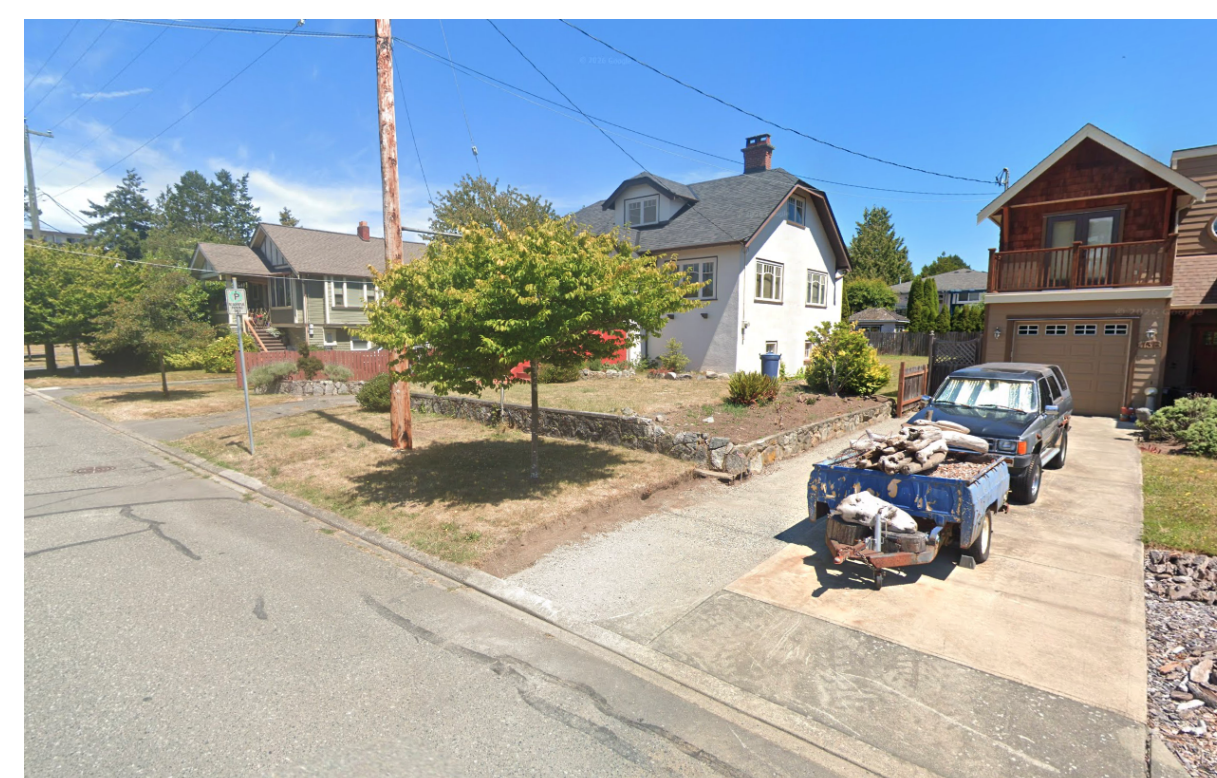
View of Subject Property (View to Northeast)