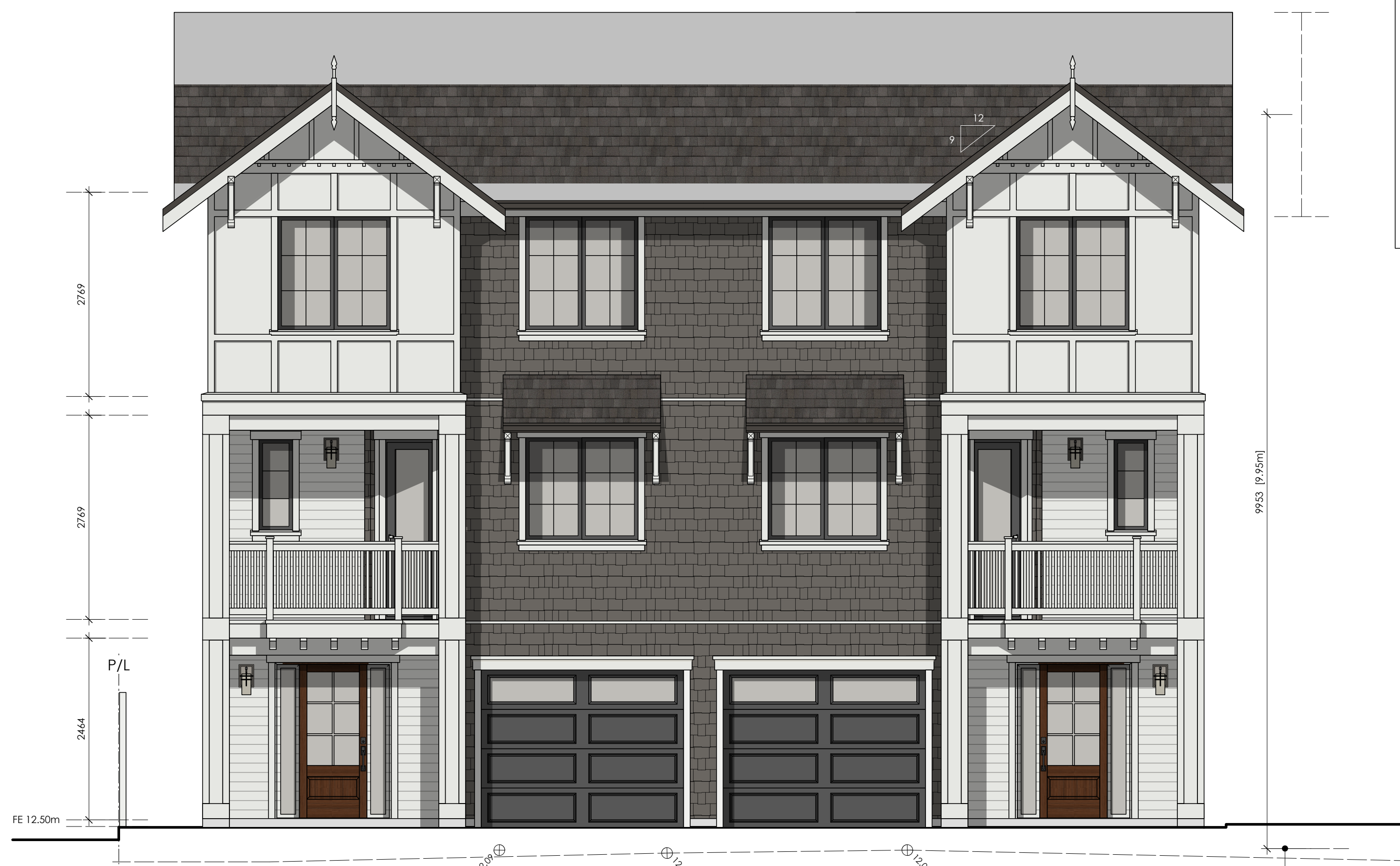
3 A3 East Elevation Scale: 1:50