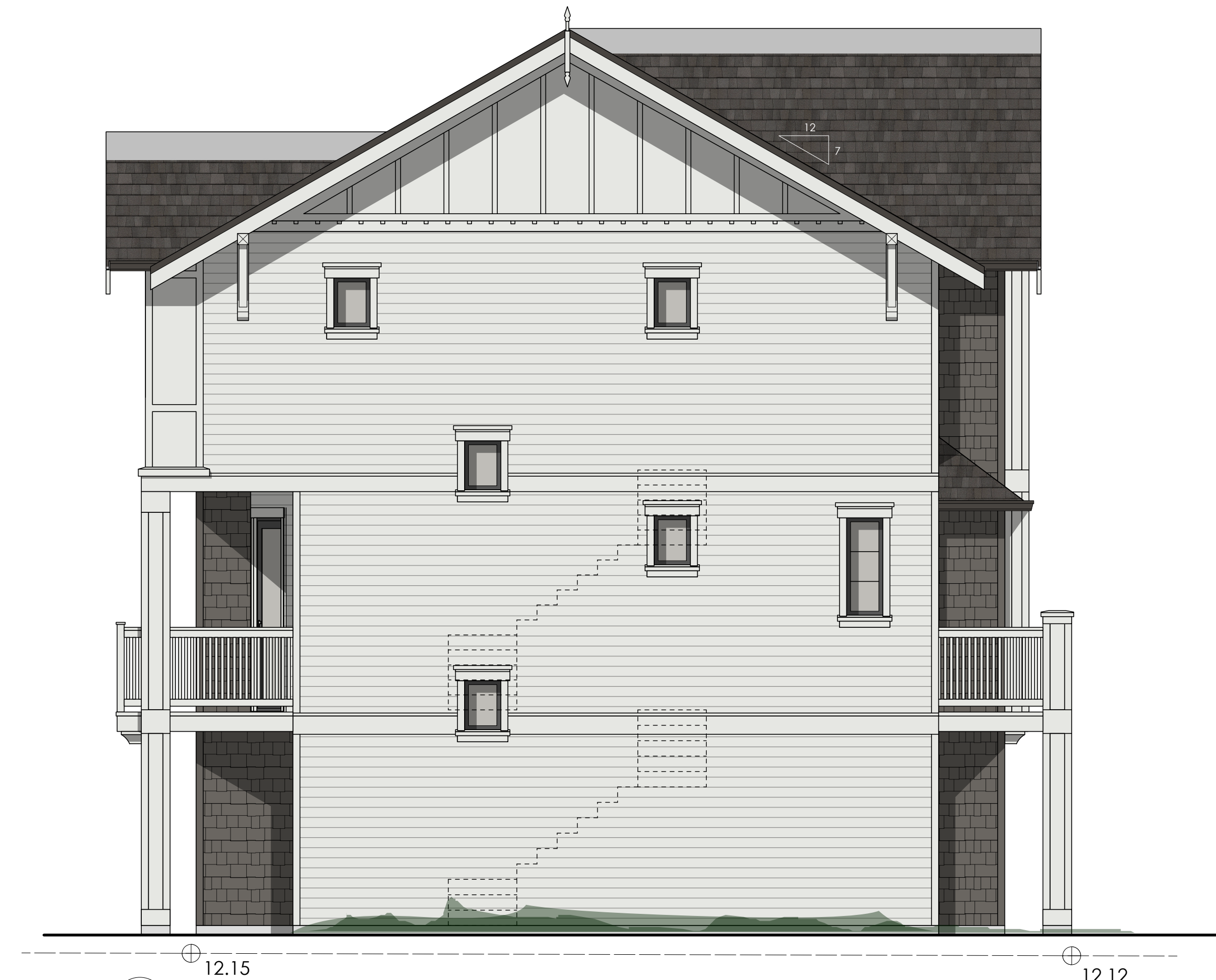
4 South Elevation A5 Scale: 1:50