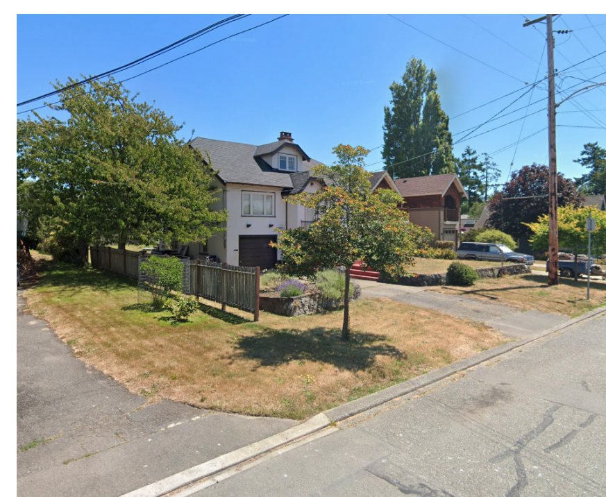
View of Subject Property (View to Southeast)