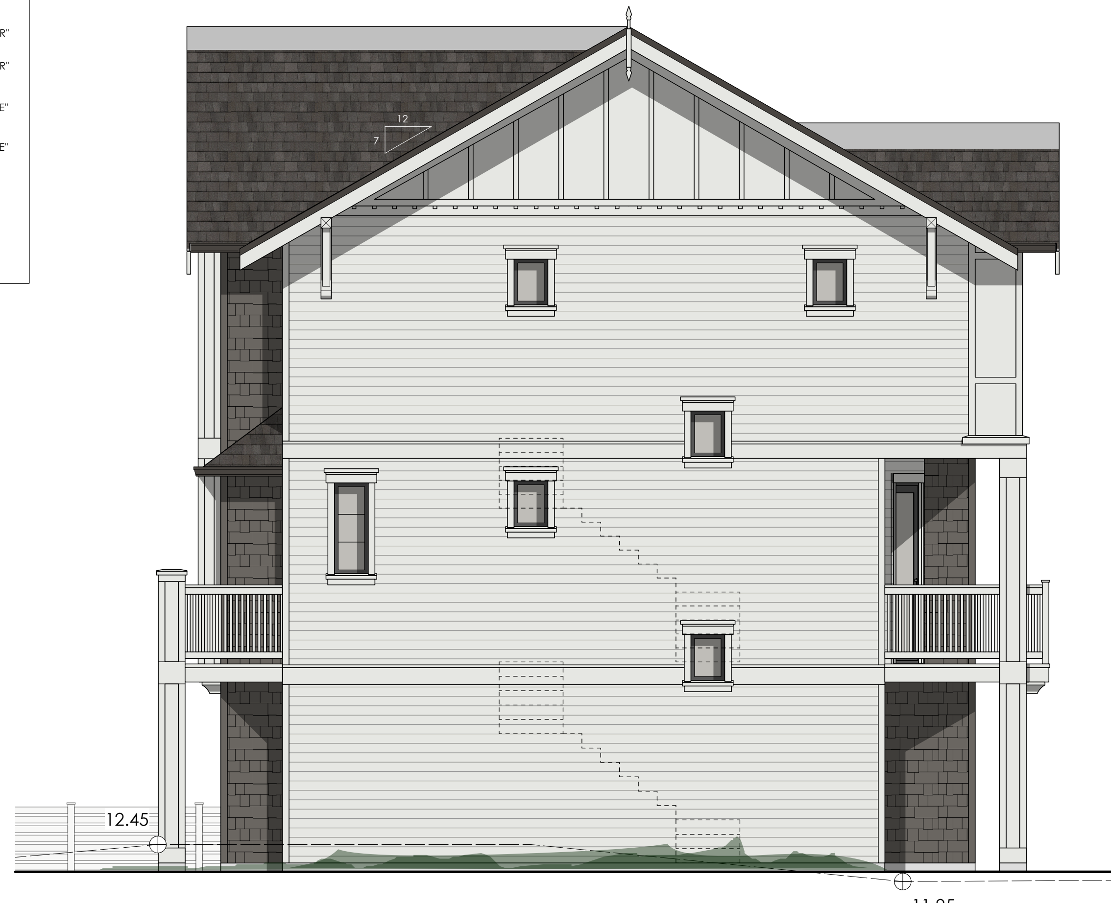
4 A3 South Elevation Scale: 1:50