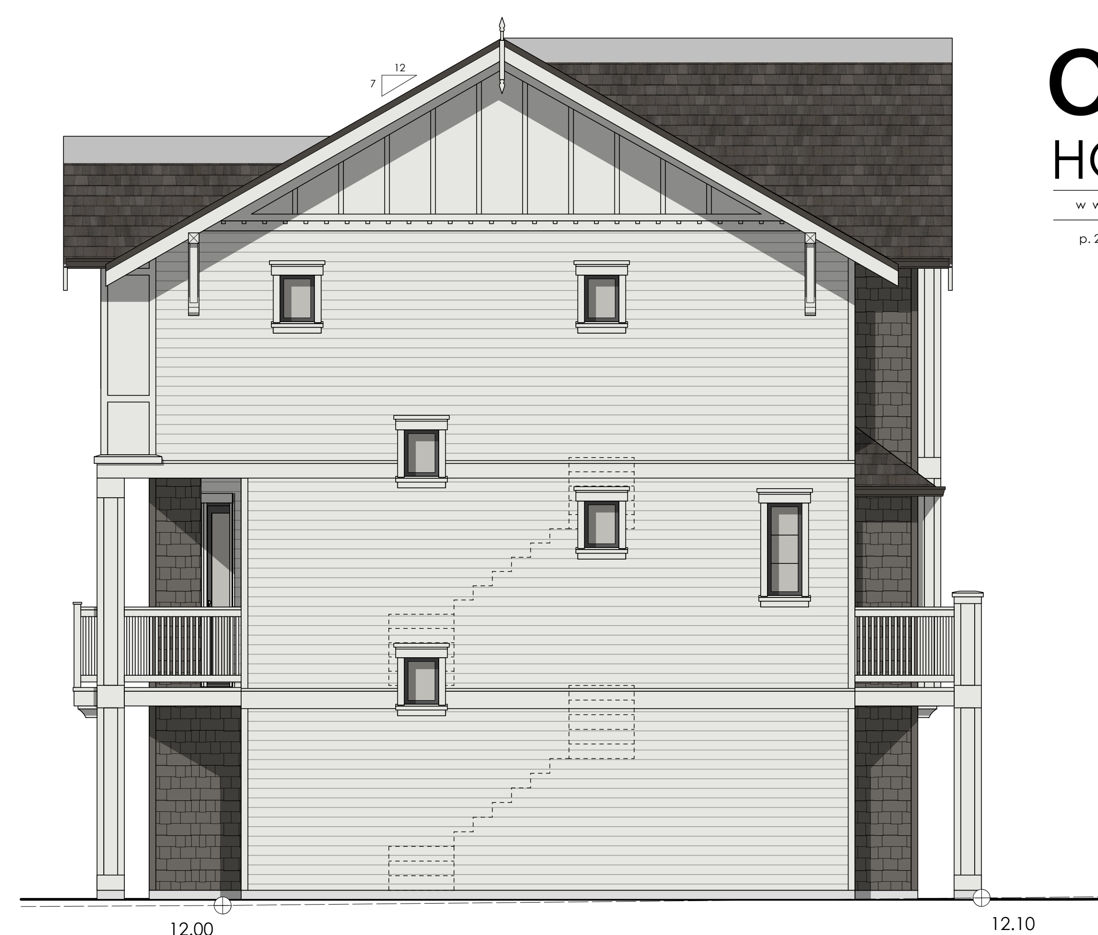
2 A3 North Elevation Scale: 1:50