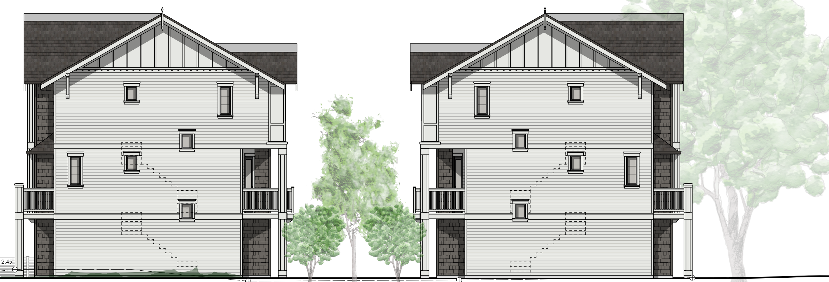
3 Proposed Project Interior Elevation, South A1 Scale: 1:100