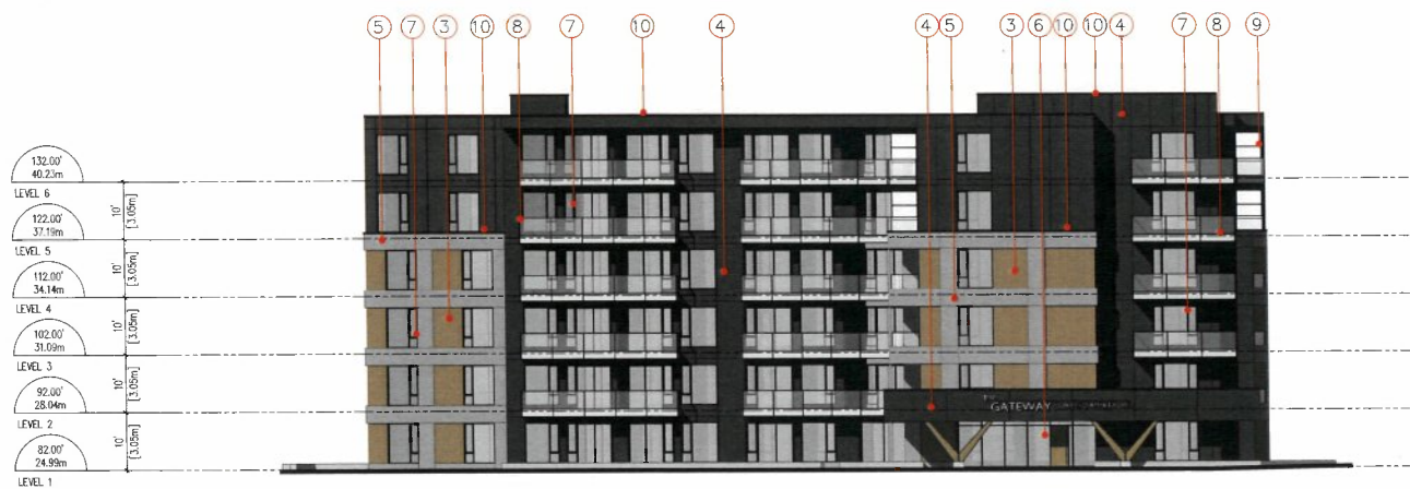
1 BUILDING B - SOUTH ELEVATION