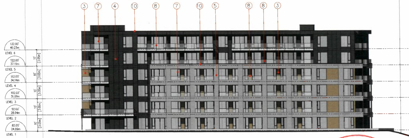
2 BUILDING B - EAST ELEVATION