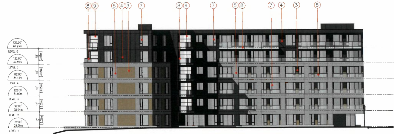
4 BUILDING B - WEST ELEVATION