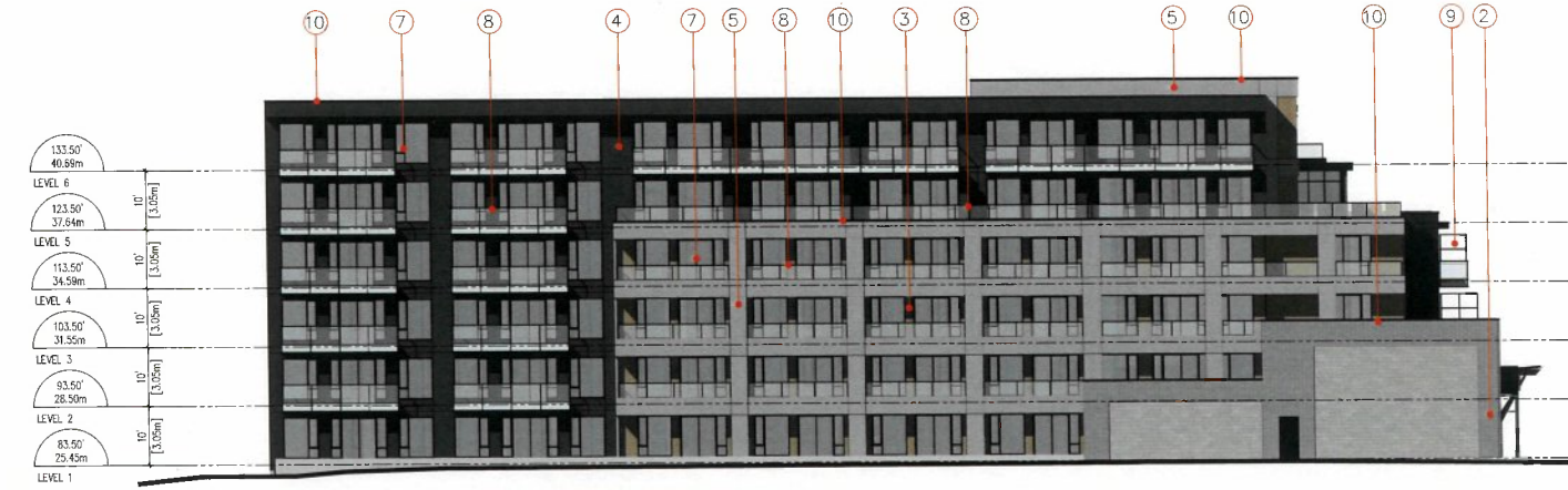
4 BUILDING A - WEST ELEVATION