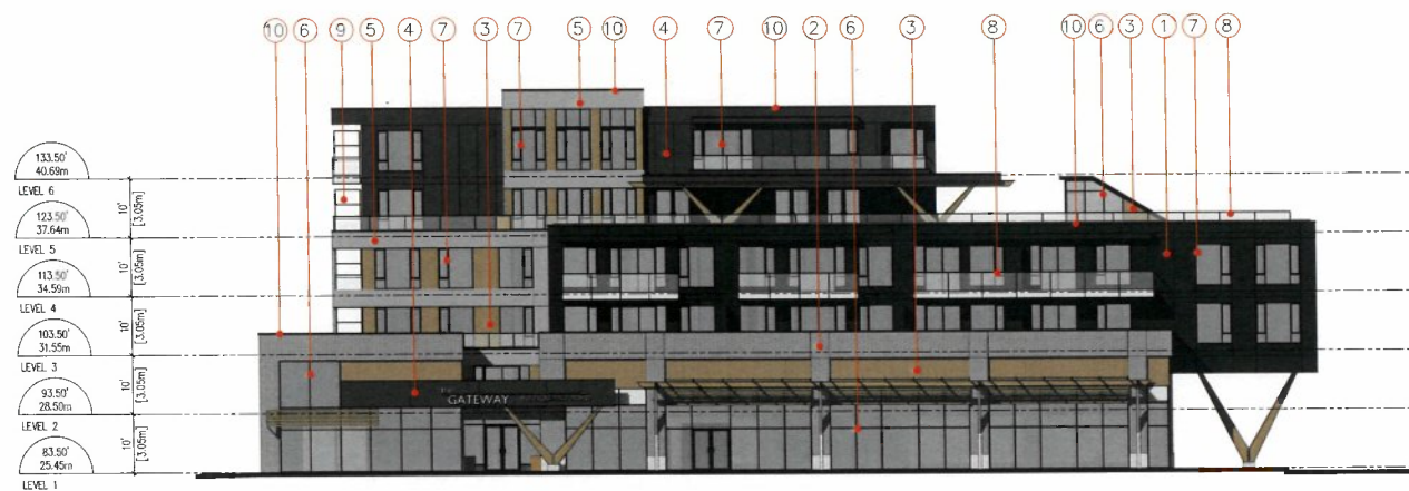
1 BUILDING A - SOUTH ELEVATION