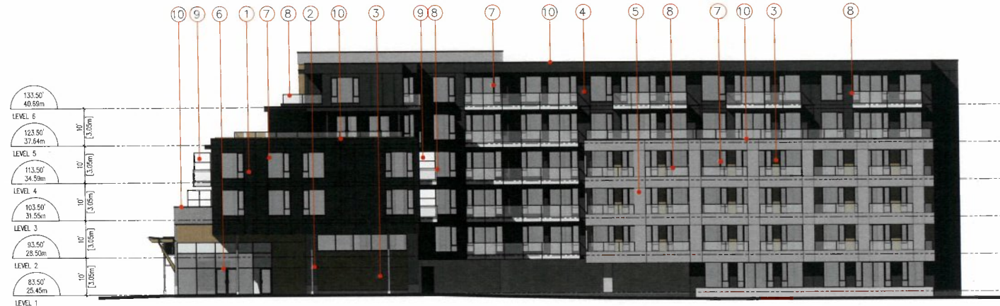
2 BUILDING A - EAST ELEVATION