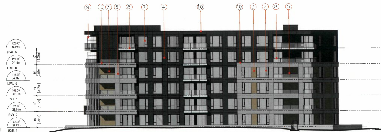
3 BUILDING B - NORTH ELEVATION