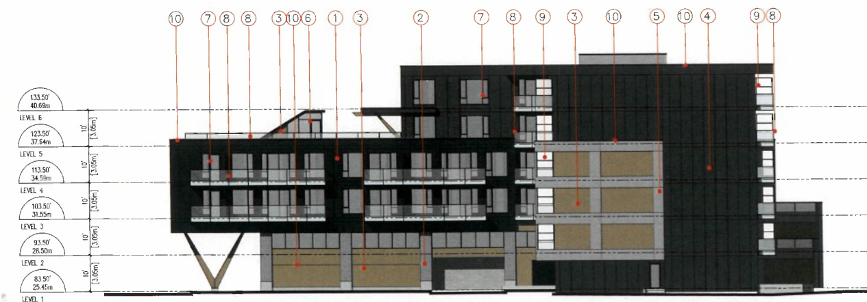
3 BUILDING A - NORTH ELEVATION