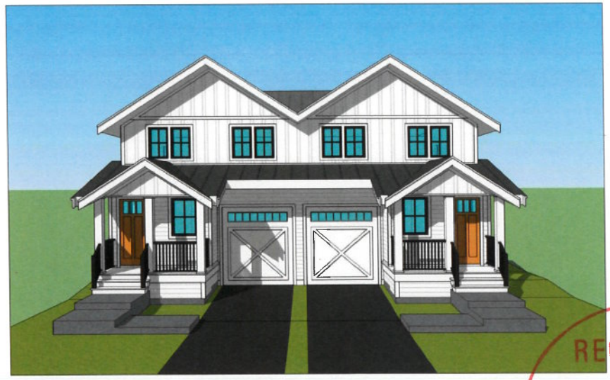
PROPOSED FRONT FACADE NORTH ELEVATION