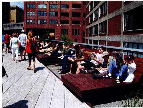
WIDE WOOD LOUNGE SEATING FEATURES ON UPPER DECK TERRACE