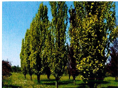
COLUMNAR STREET TREES ON GRASS BOULEVARD