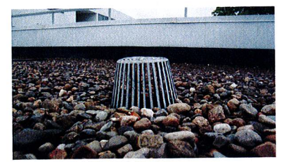
AREA DRAIN ON SLAB NOTE AGGREGATE ROCK SIZED TO BE LARGER THAN HOLES IN DRAIN COVER

APPROXIMATE LOCATION OF DRAINS ON SLAB REFER TO MECHANICAL ENG.