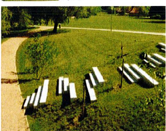
TIERED SEATING SLAB FEATURE SET IN SLOPED PLANTING BED