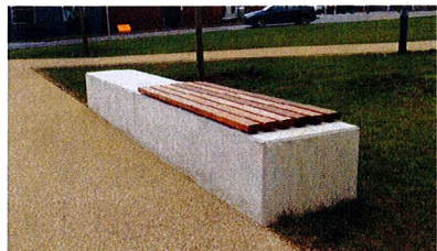
BENCH SEATING AT BUS STOP CONCRETE SLAB SEATING FEATURE IN ROW FOR PUBLIC USE

PROPOSED LOCATION FOR STREET TREES IN GRASS BOULEVARD - ROW PLANTING IN COORDINATION WITH CITY