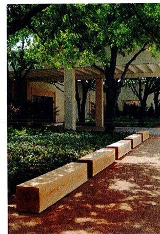
WOOD PLANTERS & SLAB BENCHES STAIN TO MATCH ARCHITECTURAL