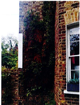
CLIMBING VINES ON METAL SCREEN PARTHENOCESSUS QUINQUEFOLIA (VIRGINIA CREEPER) & LONICERA CILIOSA (TRUMPET HONEYSUCKLE)