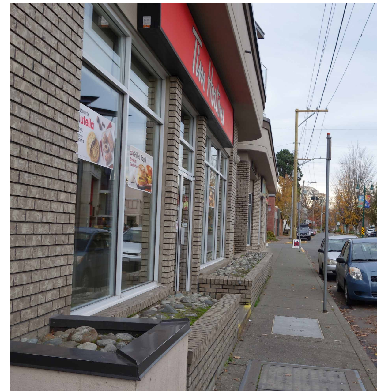
Lack of pedestrian amenities