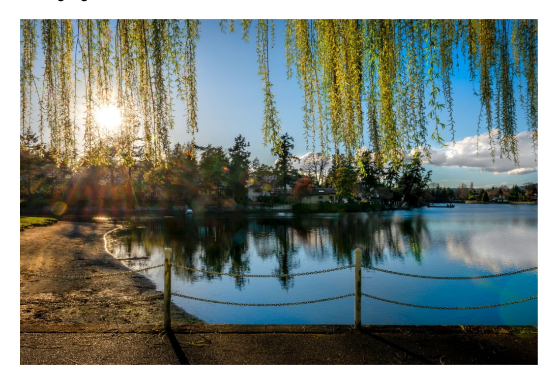
Healthy, livable and diverse community objective: "Enhance opportunities for parks & recreation."

Operational strategies are actions that work to close the gap between where you are starting from and where you want to be, how you intend to reach the strategic goal.