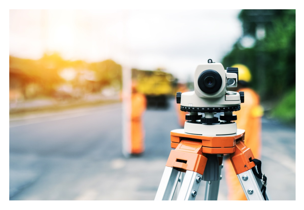
Local services and infrastructure objective: "Develop an Active Transportation Plan for completion by the end of 2020."