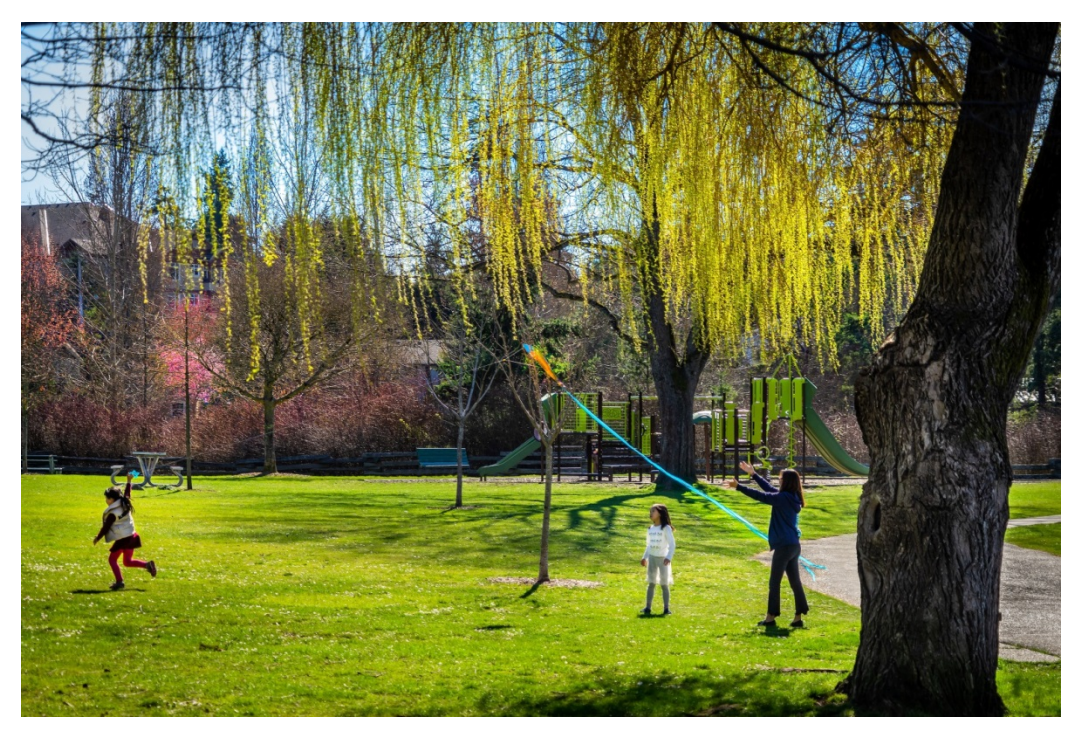
Healthy, livable and diverse community objective: "Continue to develop opportunities that promote healthy and active living."