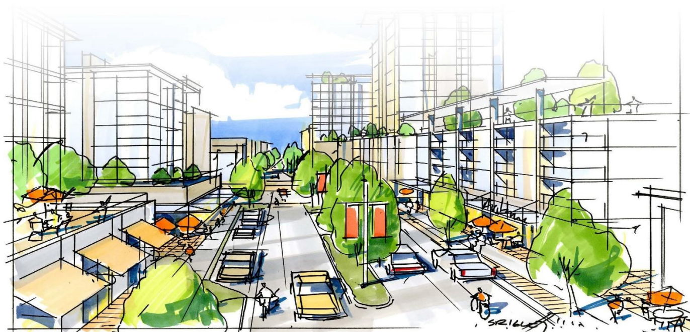
Sketch by Calum Srigley – Design Consulting