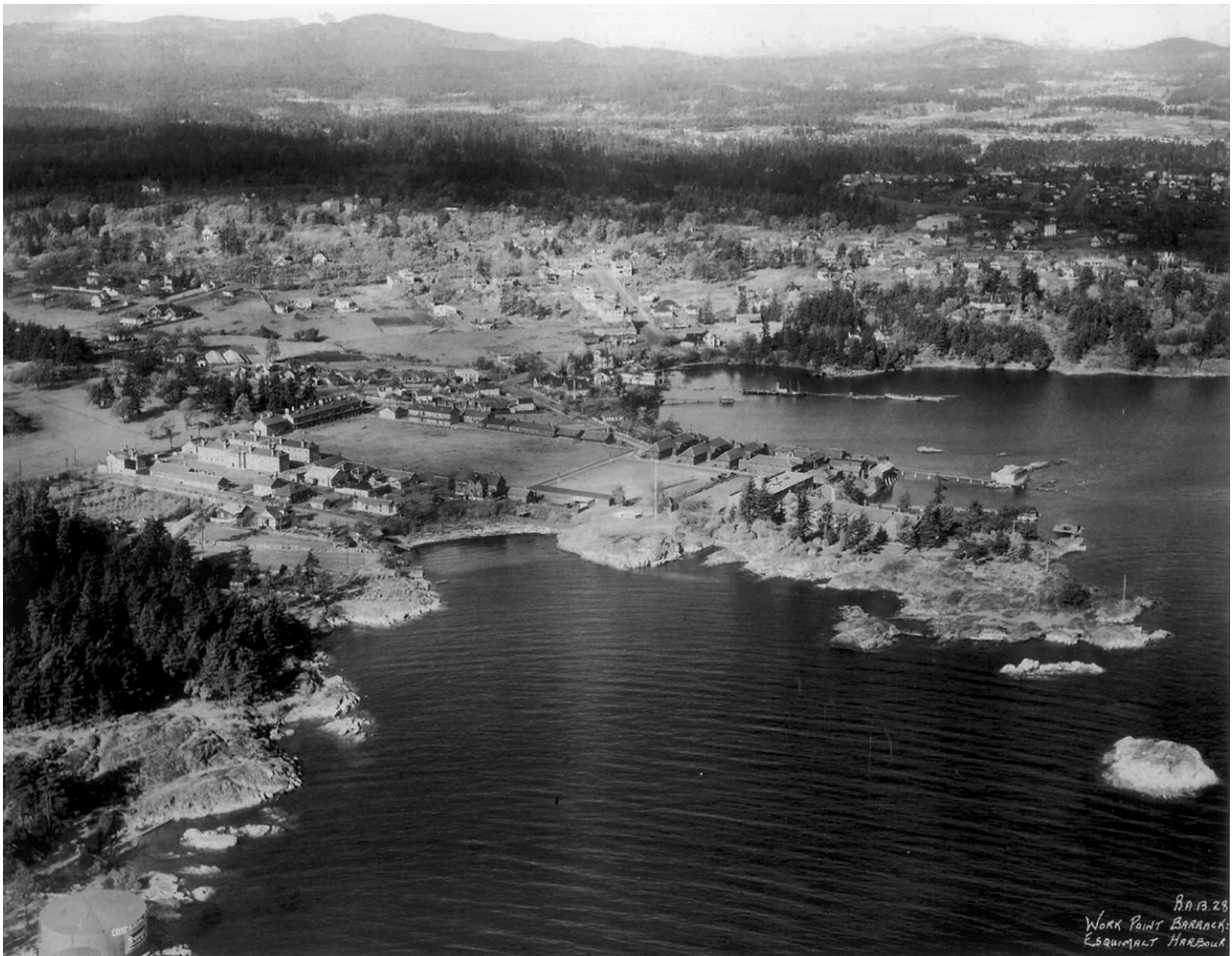
Work Point Barracks