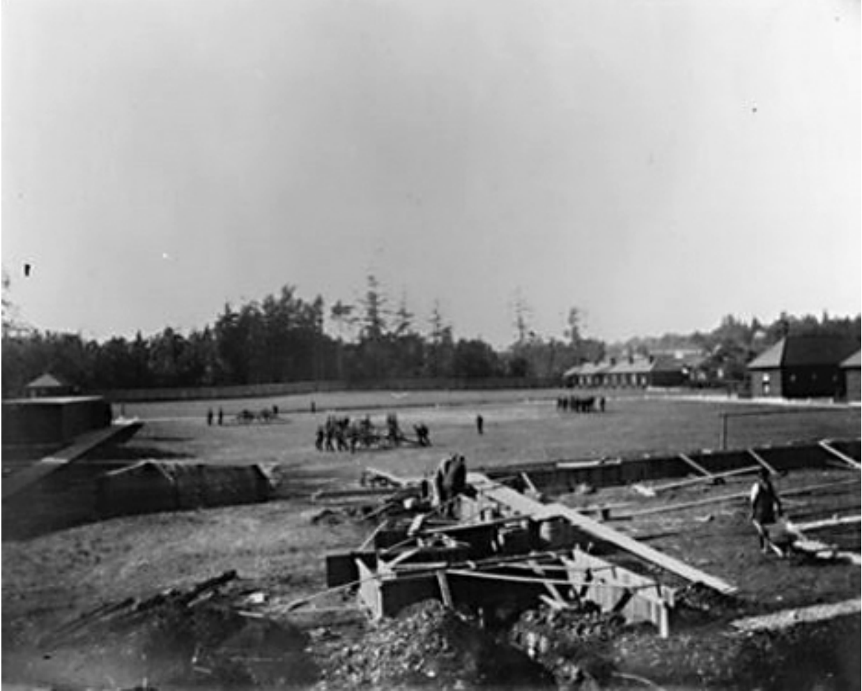
Work Point, looking west over the construction of the "Works Office" at Work Point Barracks circa 1893. In the background are the Royal Marine Artillery with their muzzle-loader carriage guns in the Parade Square and the Enlisted Men's Barracks to the far right. [Young Collection, Esquimalt Archives 994.4.7]

The 1880s brought major changes to the region. In 1886, the Esquimalt & Nanaimo Railway was constructed through the centre of Esquimalt. The following year, a military base was established at Work Point Barracks near the Victoria city boundary. It was the garrison headquarters for the first Permanent Force unit "C" Battery, Canadian Artillery for coastal defence, and played an essential role in protecting and guaranteeing Canada's sovereignty. Operation of a number of gun emplacements such as Macaulay Point, Finlayson Point and Brothers Island were necessary to protect both Victoria and Esquimalt harbours, and larger portions of Esquimalt lands were taken over by the crown for military operations. In 1887, the naval dockyard was completed, giving the Royal Navy a state-of-the-art ship repair and refitting site on Canadian soil. As the area's population grew, the presence of the Navy and the Army dominated social life both in Victoria and Esquimalt. Wealthy businessmen built large homes in Esquimalt along the shoreline, the banks of the Gorge and the rocky hillsides near Old Esquimalt Road, while more modest residential development took place in the southern part of the Township. In 1893, the gunners of the Royal Marine Artillery at Work Point built the province's first golf links on the Macaulay Plains.