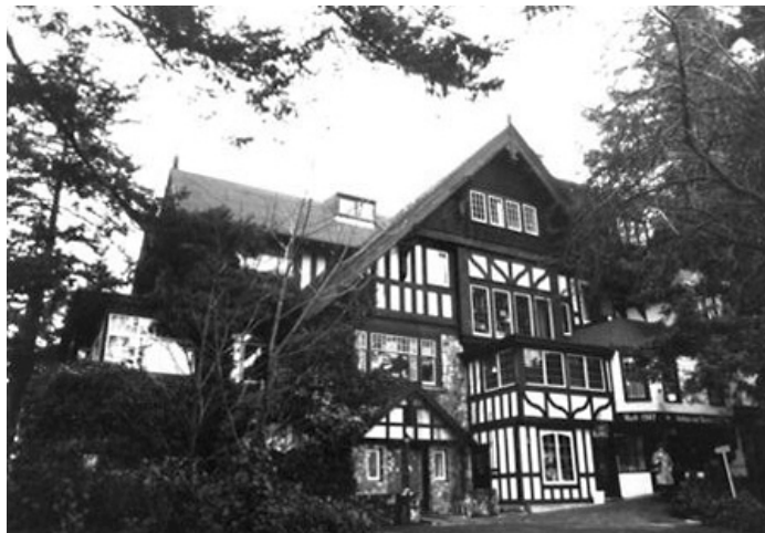
"Rosemead", the T.H. Slater Residence, Samuel Maclure architect, 1909. Now the English Inn, 429 Lampson Street, Esquimalt

The Esquimalt Archives is the most significant local collection of historic research material and is an invaluable community asset (See Section 5.12 ).