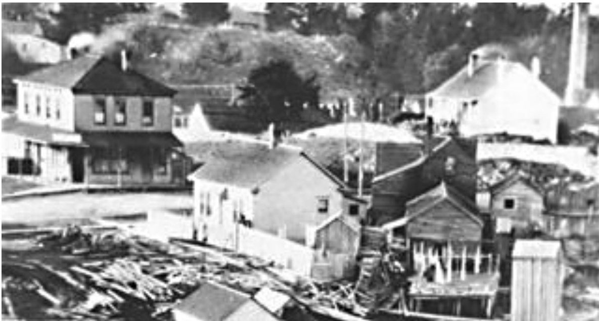
Esquimalt Old Village, pre-1904

The last British Army garrison in Canada left Victoria and Esquimalt in 1906, leaving the Government of Canada in charge of Military District #11 (BC) Headquarters at Work Point, with Canadian Artillery Gunners responsible for Coastal Defence. Although the Royal Navy abandoned the naval base in 1905, it was revived in 1910 as the West Coast base for the newly-created Naval Service of Canada [renamed the Royal Canadian Navy in 1911] and continued to play an important role – along with the Military – in the life of the community.