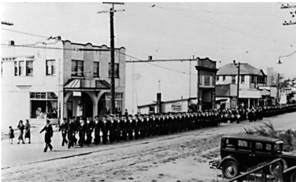
Military Parade, Esquimalt Road, 1938.