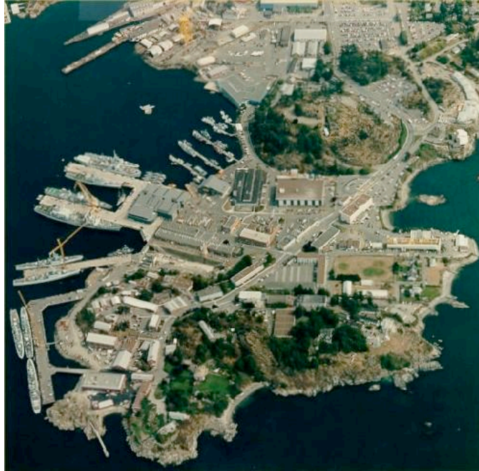
Aerial view of Esquimalt Naval Sites, ringing Esquimalt harbour, 2001.