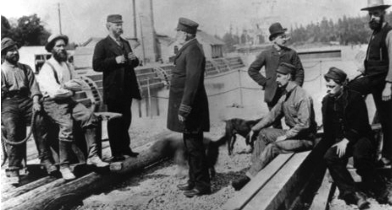
First Graving Dock, Naden, Esquimalt, 1887