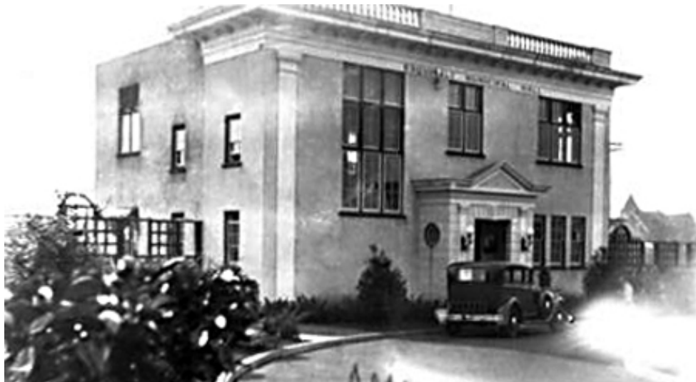
Esquimalt Municipal Hall, 1930s [Esquimalt Archives 989.36.1].