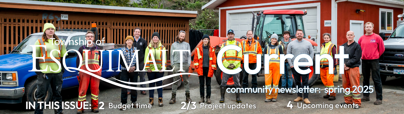
Esquimalt Parks team