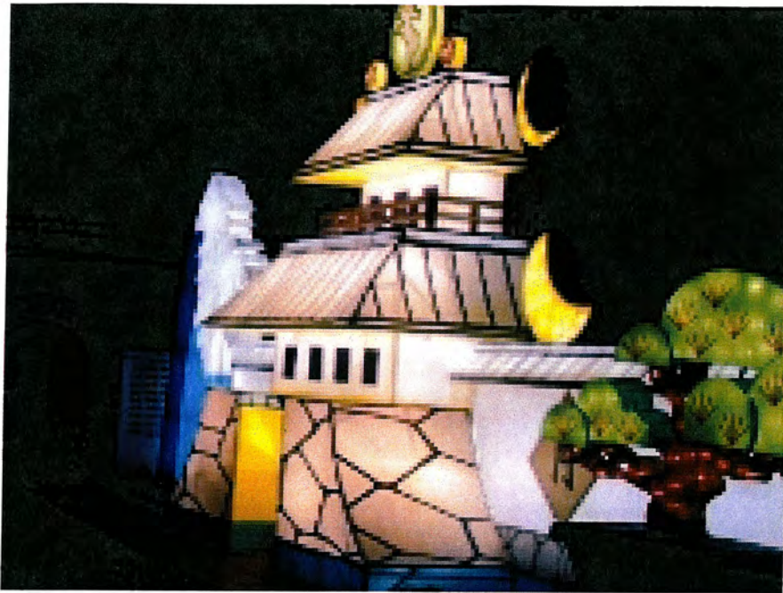
From Toronto Lantern Festival 2010